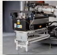
Rollled out Solder pot