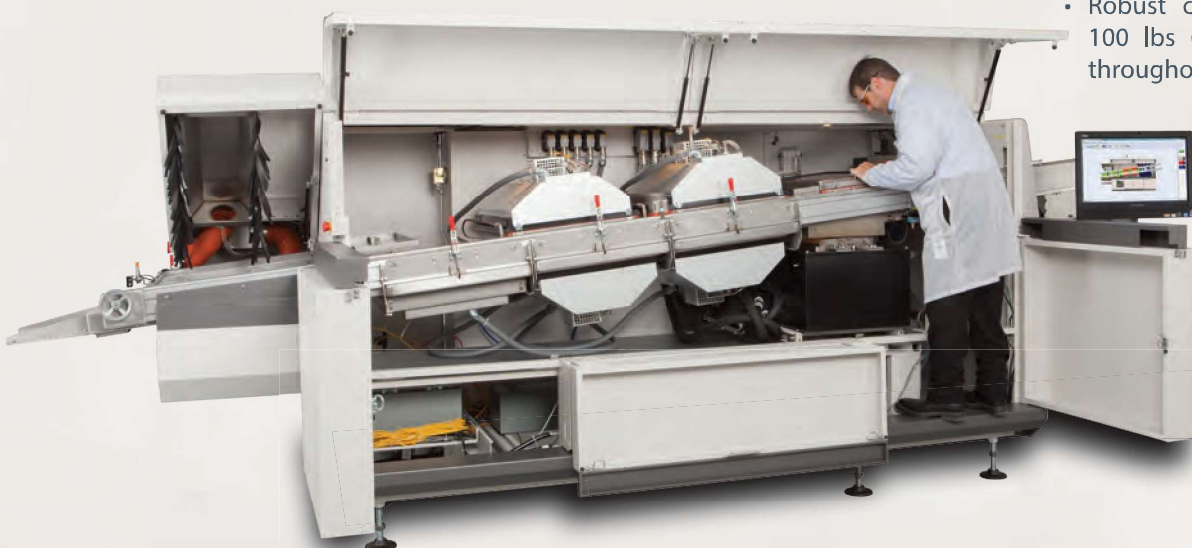
View from front with all doors and hoods open.