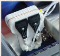
Optional Dual Head ServoJet