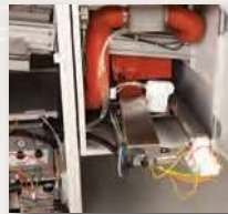
Full access to all modules