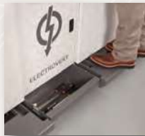
Front step with storage