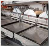
IsoThermal Convection Preheat (ICP)