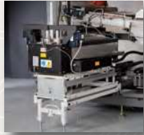
Rolled out Solder pot