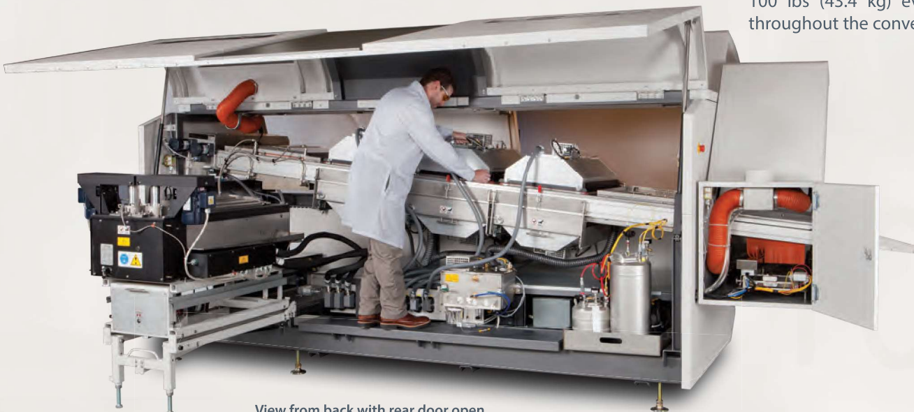
View from back with rear door open.