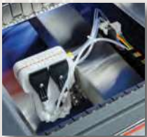
Optional Dual Head ServoJet